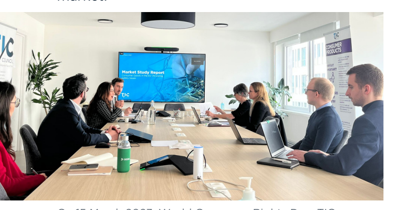
On 15 March 2023, World Consumer Rights Day, TIC Council hosted a webinar to present the results of the 2022 Market Study and draw lessons from best practices around the world.

Finally, the Conformity Assessment of Connected Devices WG was very active on all topics related to the cybersecurity of IoT and AI, finalising the White Paper on the Cybersecurity of Connected Devices and developing a paper on the role that the TIC sector will play in securing the development of artificial intelligence.